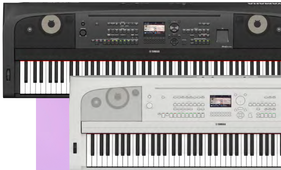
White DGX-670 available mid-year 2021

With Unison, you play a phrase while pressing the foot pedal, making the accompaniment Style play in unison with you. This lets you perform signature lines found in iconic songs or create your own signature licks for the whole band to follow. Accent lets you add rhythmic "shots" to accentuate notes of your choice simply by playing a little harder.